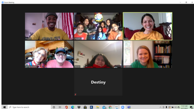
A sibling group enjoys their third virtual event in the past year at our Spring Virtual Parties

The continuity of service that we were able to achieve through this event is a great success and a testimony of the power of our year-round events. Some of the children served at this event are still not able to do in-person events due to issues of health, placement and transportation, so even as some things are returning back to "normal" there is still great value in offering virtual events.