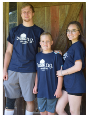
Two of our former campers have now become counselors and attended our First Summer Day Camp with their younger brother.